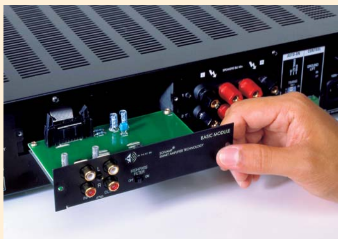
Smart Amplifier Technology (SAT) gives you outstanding flexibility to upgrade or outfit your system simply by inserting a new module.